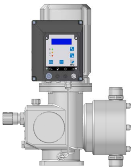
Controllable diaphragm pump, type C 410.2 (0,37 kW)