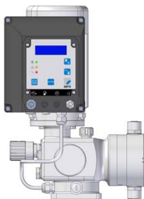
Controllable diaphragm pump, type C 409.2