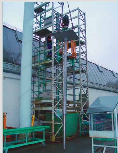
Performance test of the equipment under operational conditions prior to shipment

On drilling ships there are collection tanks holding a mixture of crude oil with sand, sea water and xylene. The tanks have to be emptied from above and the mixture has to be pumped at a pressure of about 20 bar for further treatment. For this application NEMO® immersible BT range pumps made from duplex steel (1.4462) with Viton® (FPM) stators and an NPSH(r) value of 0.1 m is suitable. Due to the high content of volatile hydrocarbon and the danger of cavitation, a pump with a low NPSH requirement should be used.