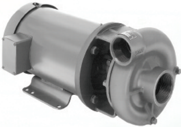
200 GPM 2" x 1½"

Series 120 centrifugal pumps are close-coupled to standard NEMA JM motors. A special adaptor protects the motor. All models are available in cast iron with a bronze impeller, or all bronze construction to suit a wide variety of liquids.