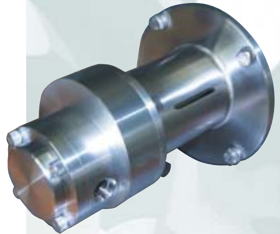
Liquiflo MAX™ Series Helical Gear Pump