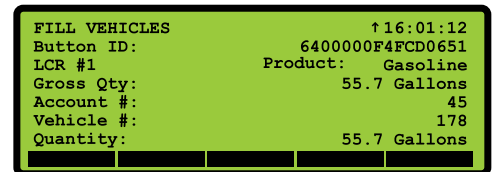
FleetConnect Fill Vehicles Screen

DMS i1000 FleetConnect application software combines the metrological data from the LectroCount register with your company's operational data to produce a complete record of delivery activity. FleetConnect is designed to automatically capture fueling data, reduce fueling time and errors, increase accuracy, and track and record all aspects of the delivery of fuel. DMS i1000 FleetConnect has a number of capabilities and features including: fueler security settings, vehicle identification, delivery start and stop, recording and tracking deliveries, shift reports, and data transmission to FleetConnect Office.