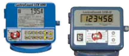
LectroCount LCR 600 and LCR-II

LectroCount registers is a microprocessor-based electronic meter register that provides metrological data to DMS i1000 FleetConnect during custody transfers. LectroCount registers can be Weights & Measures approved and mounted directly onto the meter. Temperature compensation is available to correct volume measurements to a programmable base temperature. LectroCount registers are a more reliable, accurate, cost-effective alternative to mechanical registers.