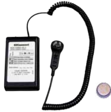
EZConnect Button Reader and RFID Button

Together, the EZConnect button reader and the RFID buttons identify vehicles and equipment before each FleetConnect delivery. RFID buttons have a unique ID number that the EZConnect can read and send, wirelessly, from the fueling point to the DMS i1000 inside the truck cab. A RFID button is attached to every vehicle and piece of equipment in the fleet. The vehicle's data and its RFID number are saved together in the FleetConnect database, so when EZConnect reads a button, the vehicle data is pulled from the database for the delivery. Vehicle data can include product type, location, customer account, name, number, and tank size. RFID buttons are attached to vehicles close to the fueling point where fuelers can read the button and still open the nozzle to make the delivery.