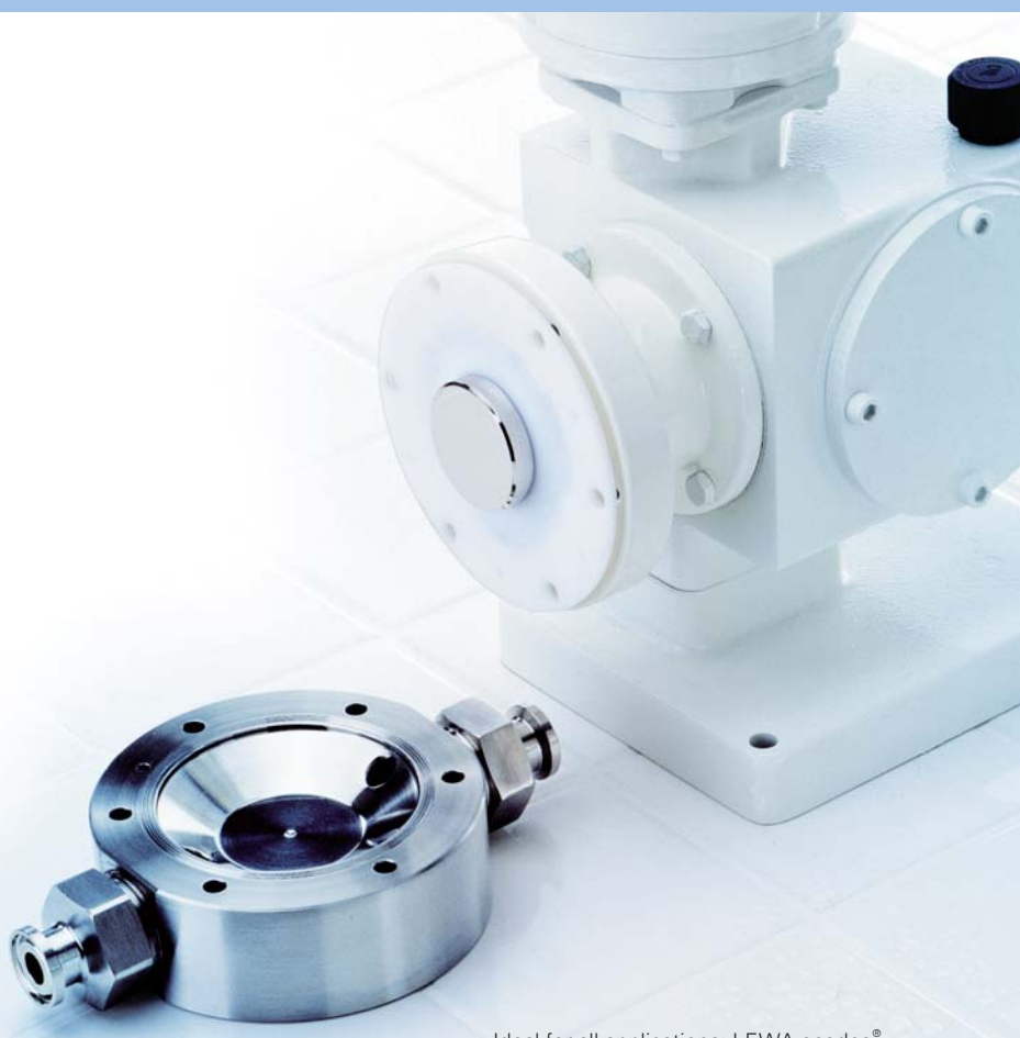
Ideal for all applications: LEWA ecodos® – the ultimate sealless diaphragm pump with low hold-up volume and polished wetted surfaces.

LEWA diaphragm pumping technology makes it possible to handle shear-sensitive and expensive ingredients in a hermetically sealed pumping environment and with gentle pumping action. Due to the extreme low hold-up volume in the pump head and the pressure-stiff characteristics of diaphragm pumps, fluids pass through the pump head quickly and without inefficient slippage.