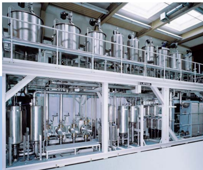
Complex systems for proportional blending or transfer of multiple product streams