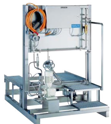
LEWA pumps have many configurations that run the range from simple metering to skids for introducing micro-ingredients.

Extensive documentation is a matter of course at LEWA. Included with the operating manuals are technical data sheets, cross-sectional drawings, material traceability and wear and spare parts lists. Test reports, pressure tests and output diagrams are available as options.