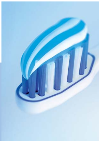
Metering of colours, flavours, or preservatives.