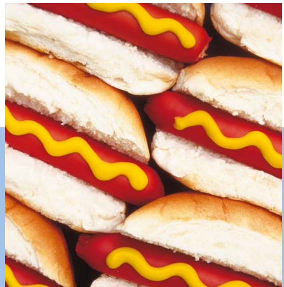
Transfer of mustard and other viscous products.