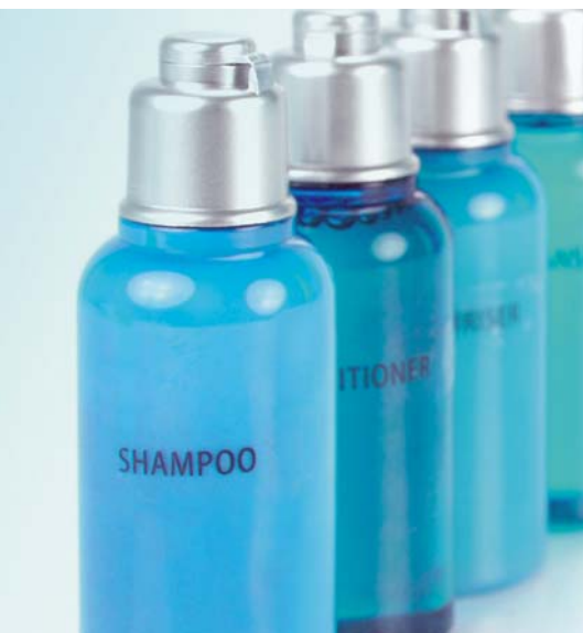
Proportional blending of liquid ingredients.