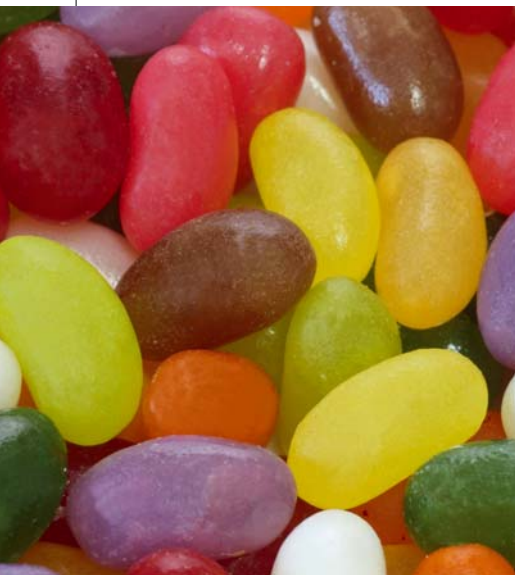
One pump for many applications: Production of jellied sweets.