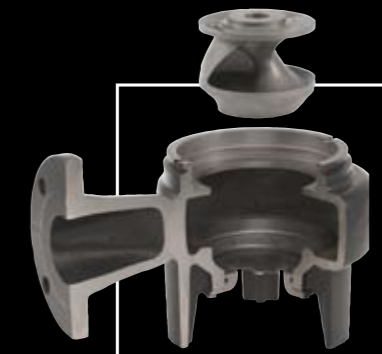
SL1: Single-channel impeller