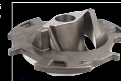
SEG Cutter System

The Grundfos patented grinder system ensures the reliable and efficient grinding of solids to even smaller pieces. In addition to extremely effective and reliable operation, service is easy, with quick dismantling for replacement of wear parts requiring no special tools.