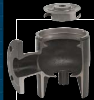
SLV: SuperVortex impeller

The SLV pumps range has a SuperVortex impeller and is ideal for liquids with a high concentration of solids, fibres, or gassy sludge, while the SL1 pumps range has a single-channel impeller and is ideal for large flows of raw sewage.