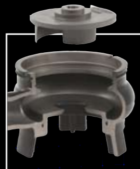
EF: Open single-vane impeller