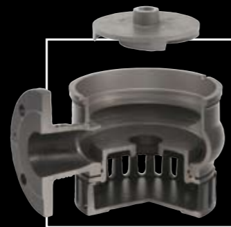
DP: Semi-open multi-vane impeller