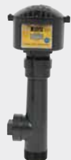
Tank Level Monitor