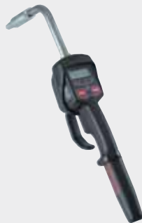
EM5™ Electronic Oil Meter