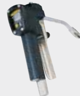
Accu-Shot™ Metered Grease Valve