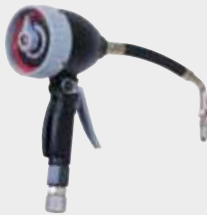
Mechanical Meter 16 Quart Standard Oil Meter