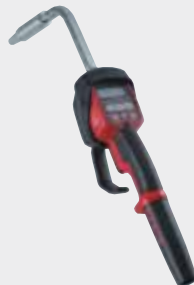
PM5™ Pre-Set Electronic Oil Meter