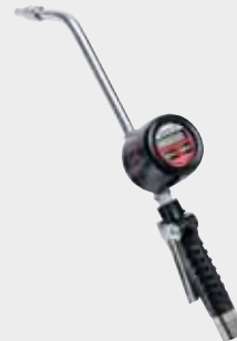
EM6™ & EM12™ Weather Resistant Electronic Meters