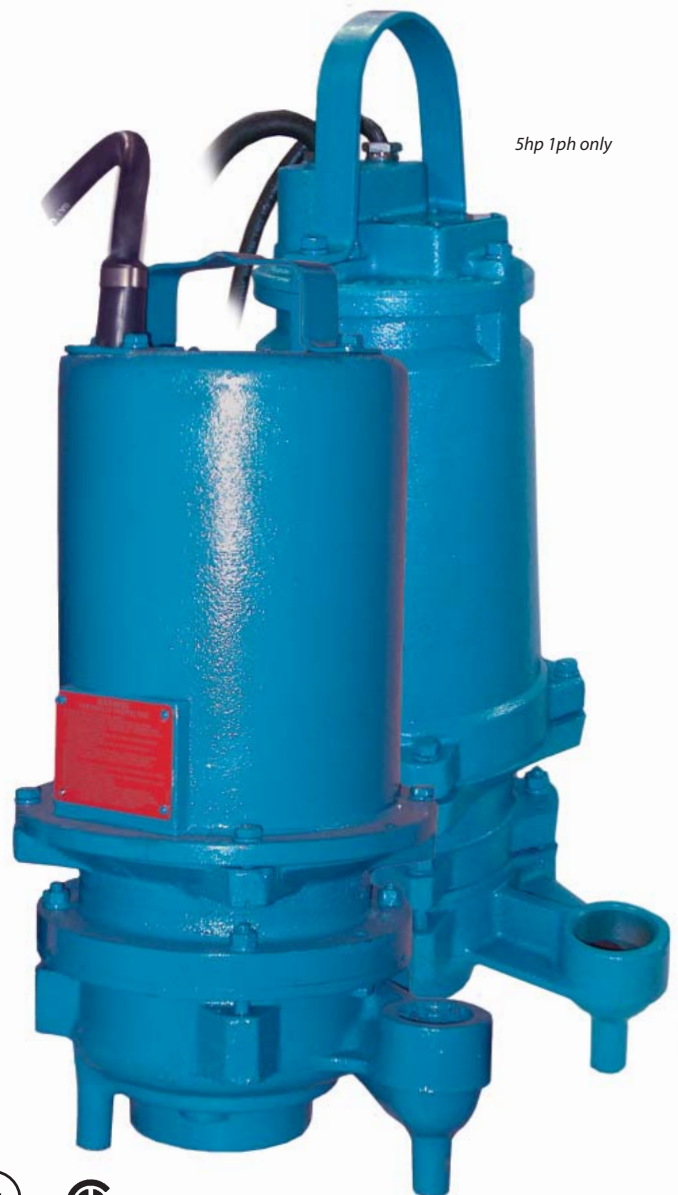
5hp 1ph only

Exclusive non-fouling controls eliminate routine, maintenance service calls.