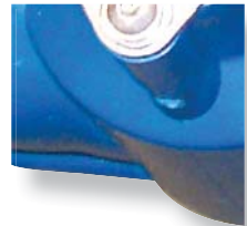
Quick Connect Power Cord