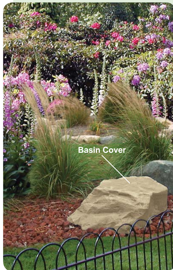
The Barnes EcoTRAN System basin cover readily adapts to virtually any landscape design, blending in with the natural environment surrounding it.

Quick-connect cords were designed to simplify pump and level control connection, allowing for rapid component swapping if needed. All systems are equipped with standard alarm boxes with circuit breakers, eliminating the need to decipher through complicated, customized control panels, or optional boxes with generator receptacles.