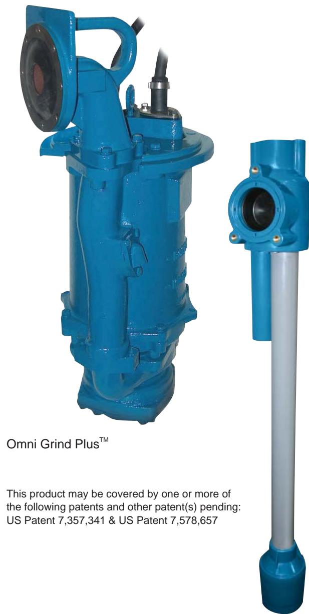
Omni Grind Plus™

This product may be covered by one or more of the following patents and other patent(s) pending: US Patent 7,357,341 & US Patent 7,578,657