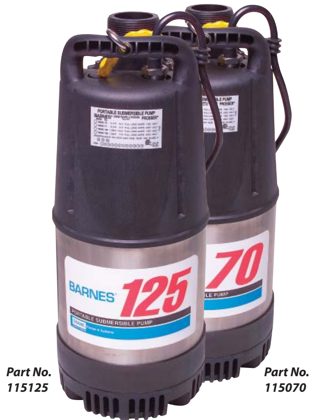
Part No. 115125