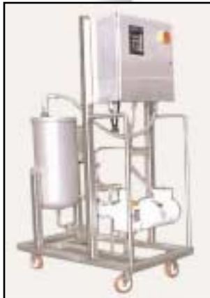
LIQUID INGREDIENT INJECTION