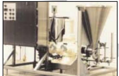
YOGURT BLENDING SYSTEM