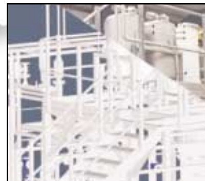
PROCESS SYSTEM DESI