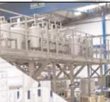
GN AND FABRICATION