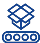
Packaging and Production Machines