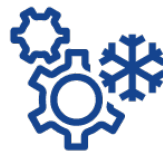
Process and Industrial Refrigeration