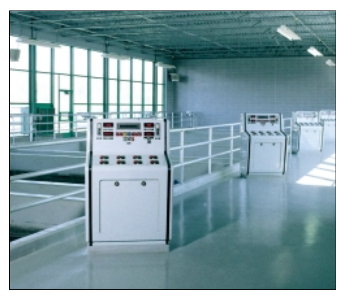
Behind every FilterWorx ACS installation is more than 75 years of Leopold filter and filter control experience. We know filters and how to control them.