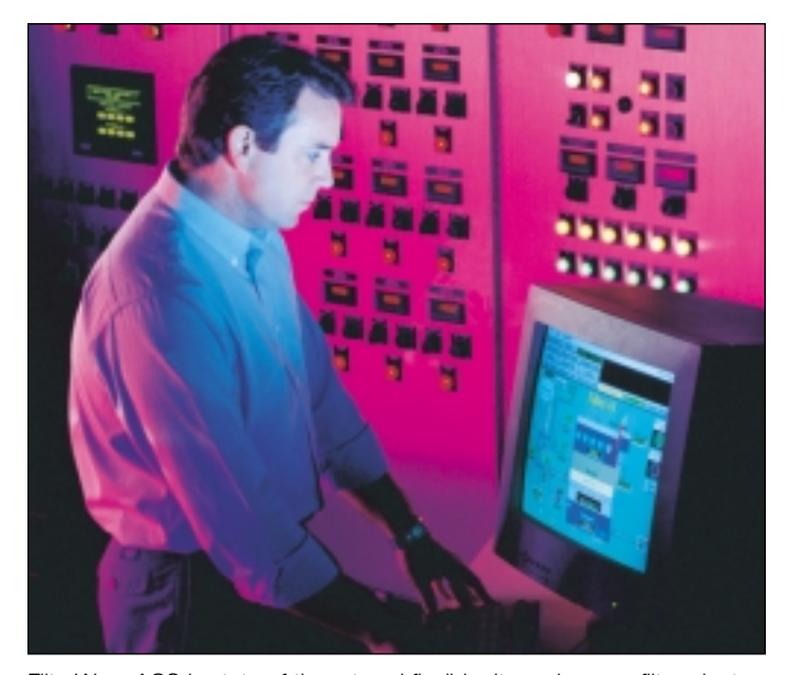
FilterWorx ACS is state of the art and flexible. It can be your filter plant SCADA or it can easily be integrated into your existing SCADA.

The FilterWorx™ Automatic Control System by Leopold is a complete filter control package consisting of all instrumentation and control equipment for the automatic monitoring and control of municipal water filtration systems. FilterWorx ACS delivers the efficiencies and economies so necessary for today's municipal water filtration systems, and the 75 years of filter process and control knowledge you can get only from Leopold.