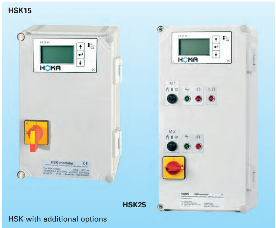
HSK with additional options