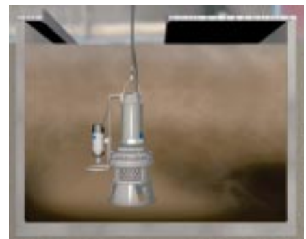
Side-mounted mixer for the really tough jobs.