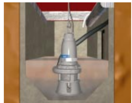
Internal cooling for pumping down to low levels.