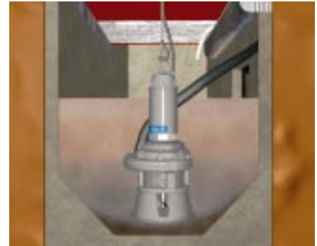
Agitator for coarser slurries.

Standardized for portable, wet installation, 5100/5150 slurry pumps are versatile and easy to install. Each pump is supplied with a built-in support stand and is free-standing, requiring no additional support structure. The Victaulic® flange and coupling allows fast, easy connection to a wide range of commonly available fittings.