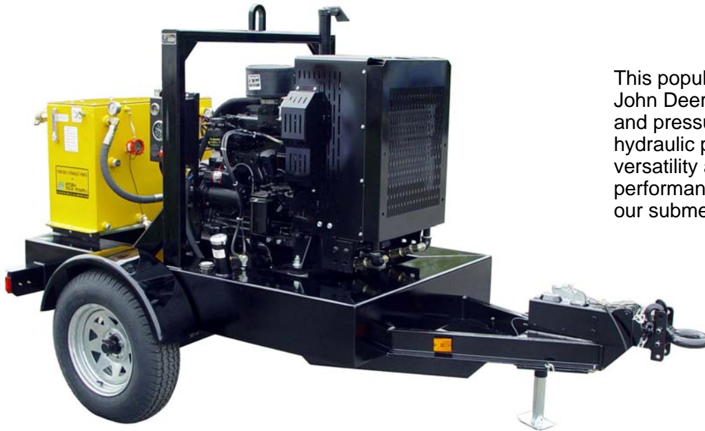
Unit shown with optional hydraulic brakes and lighting kit

This popular unit features a John Deere diesel engine and pressure compensated hydraulic pump for maximum versatility and enhanced performance when driving our submersible pumps.