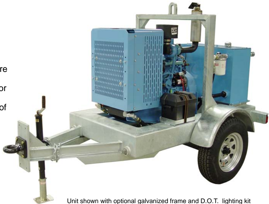
Unit shown with optional galvanized frame and D.O.T. lighting kit

This unit features a John Deere diesel engine (Interim Tier 4) that meets CARB standards for engines under 50 HP. It is designed to power many of our pumps including the S4CSL and S6TC.