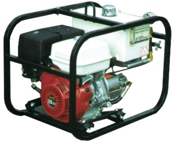
Unit shown with standard roll cage frame Optional wheel kit is available

This Honda powered gas power pack is ideal for driving our 3" trash pump and even our 6" high-volume propeller pump. It also can provide hydraulic power to run many other hydraulic tools now available.