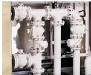
Optional discharge and suction line bypass pump connections available.