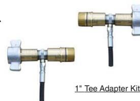
1" Tee Adapter Kit

1/2" kit Part# 5505030 3/4" kit Part# 5505031 1" kit Part# 5505052