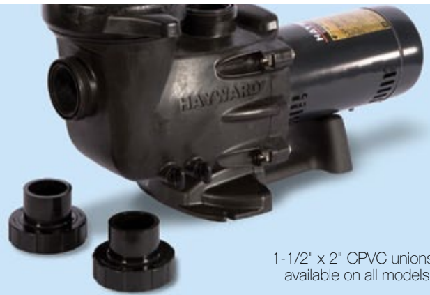
1-1/2" x 2" CPVC unions available on all models.

Max-Flo II provides exceptional value by building upon the outstanding reputation of the original through updated features such as CPVC unions, an elevated motor base and a larger leaf holding capacity strainer basket. For a great pool experience every time, count on Max-Flo II.