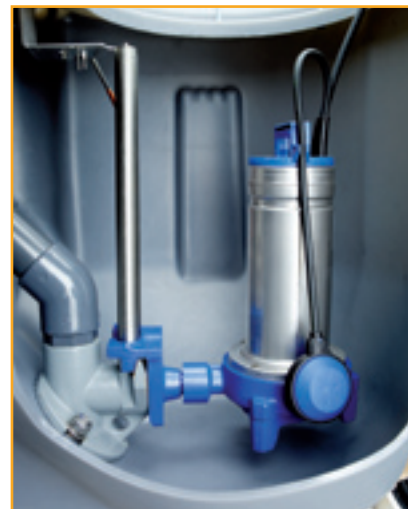
Stationary wet installation directly to a discharge connection using guide bars when fitted with a sliding bracket. Here in a Flygt Micro 7 station.