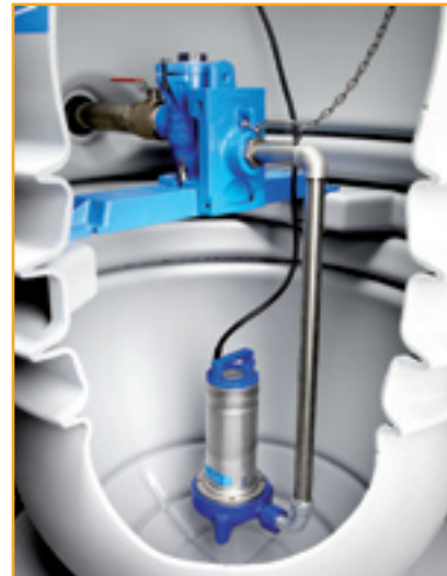
Stationary installation suspended from a discharge pipe and fitted with an outlet bend. Here in a Flygt Compit station.