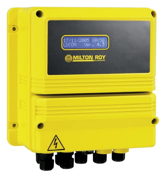
DCOM 3000: remote control device for D3000 series